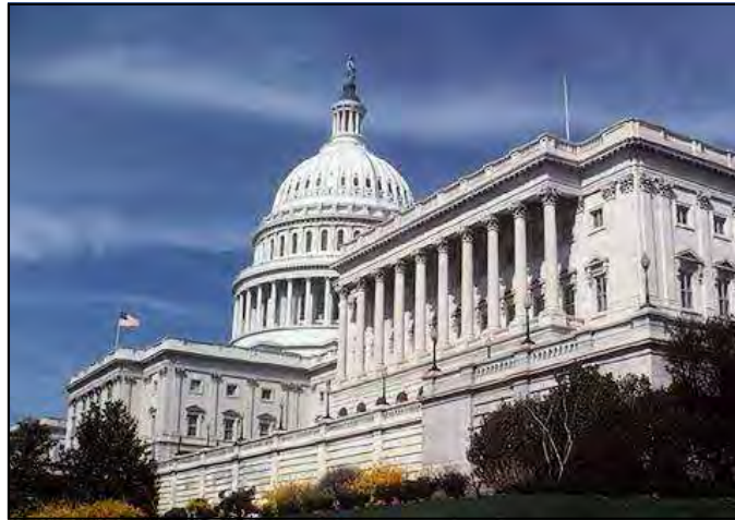
THE CLEAN ENERGY BILL WILL SOON BE DEBATED.

“The boom-and-bust periods need to stop. There’s a significant amount of